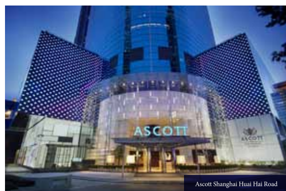
Ascott Shanghai Huai Hai Road

至2020年，我们预料可在中国拥有及管理达20,000套物业，而全球的物业单位也将增至80,000套。除了传统的推广渠道，旅行者也可通过阿里巴巴的飞猪搜寻海外20个热门城市的15,000套服务公寓，当中包括中国旅客最爱的新加坡、曼谷、东京、巴黎及伦敦。