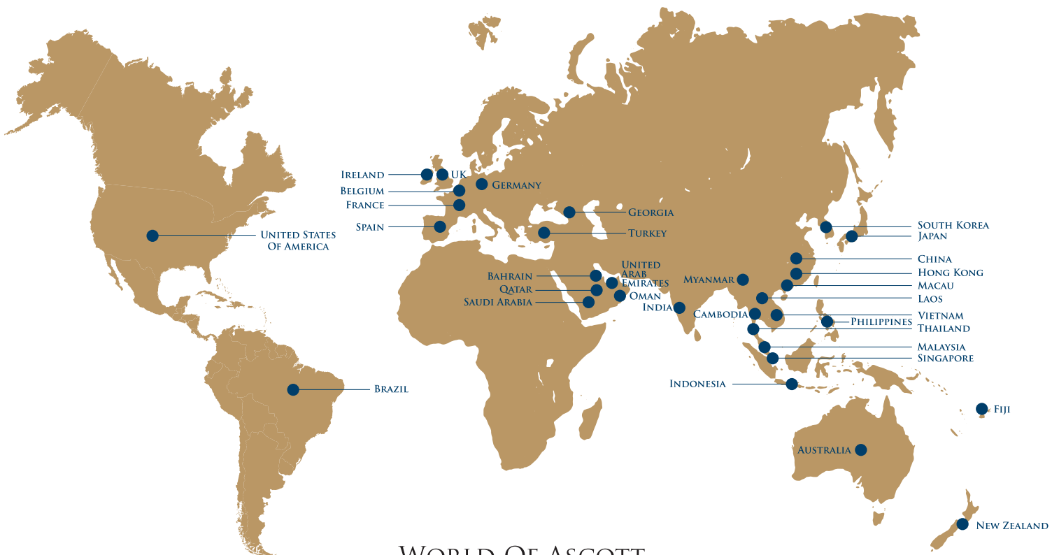
WORLD OF ASCOTT 雅诗阁世界版图

Express Check-In & Check-Out Services 快速入住与退房服务