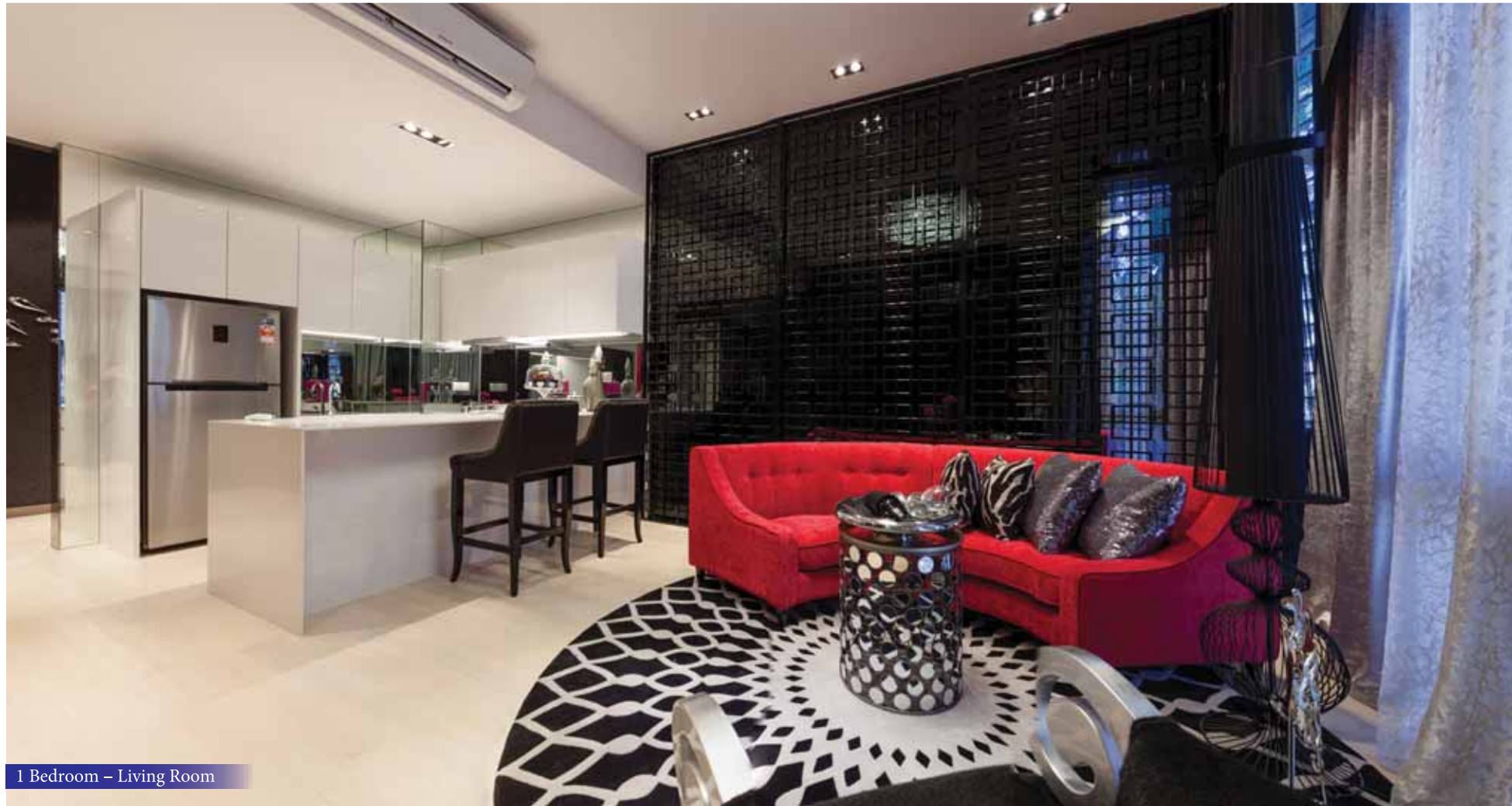
1 Bedroom - Living Room