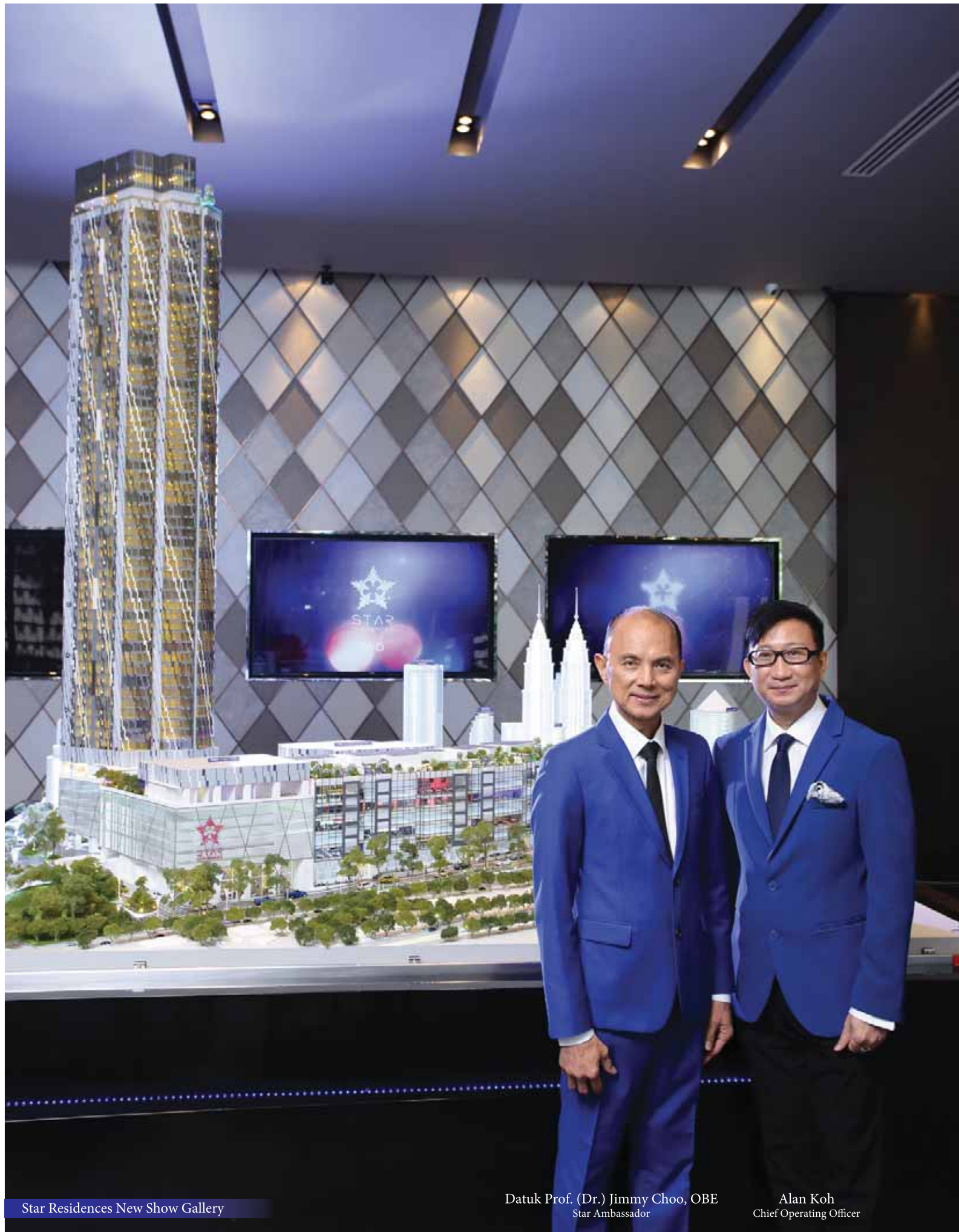
Star Residences New Show Gallery