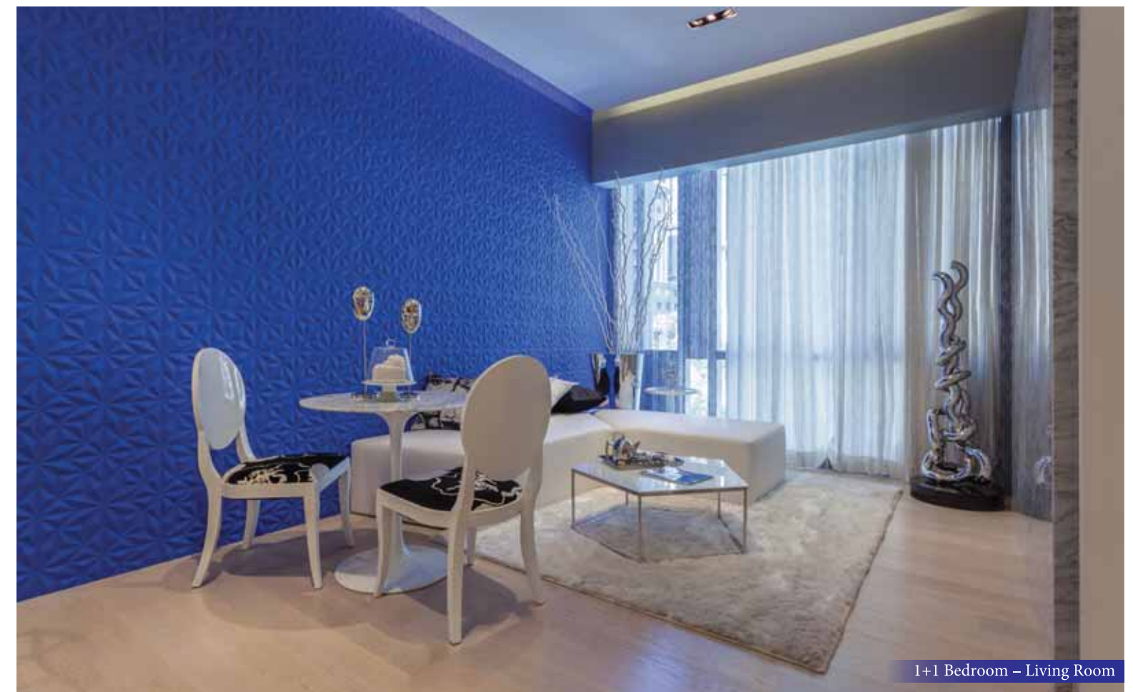
1+1 Bedroom - Living Room