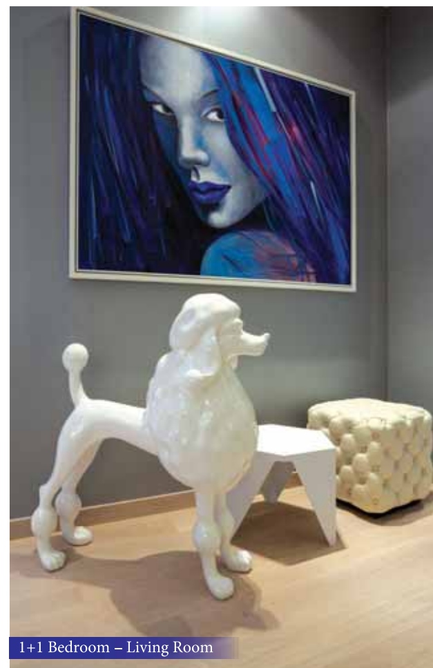
1+1 Bedroom - Living Room