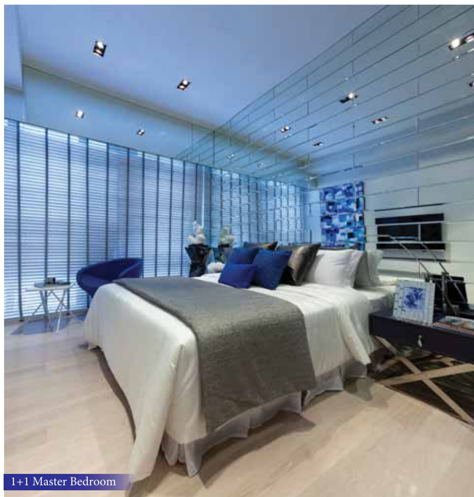
1+1 Master Bedroom

Star Residences 的展示廊于2015年12月落成，并向公众人士展示家具全备的单位，以名牌家具作为室内陈设，彰显细致入微的设计。展示廊每日开放时间，由上午10时-下午5时。星期日与公假照常开放。